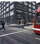
Green building standards were used to turn the site of an historic Portland, Oregon brewery into a thriving new neighborhood

That business strategy has guided Gerding Edlen, a real estate development company in Portland, Oregon. Among its landmark projects was transforming an historic, sprawling brewery compound into a neighborhood of offices, stores and homes. The company applied green building standards, deployed solar panels, recycled almost all construction waste, put parking lots underground and installed green roofs.