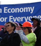
Thousands of workers gather at the U.S. Capitol in support of the Employee Free Choice Act that promotes bargaining for better wages and job benefits